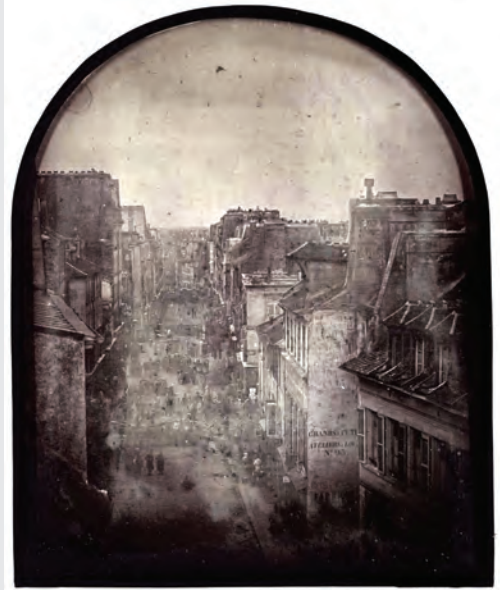
Above and right: Daguerreotypes taken by Thibault on 25 and 26 June 1848. below: The copied engravings published in l'Illustration , 1 July 1848.